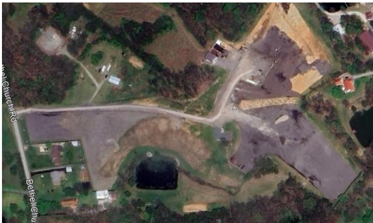
Site in 2025